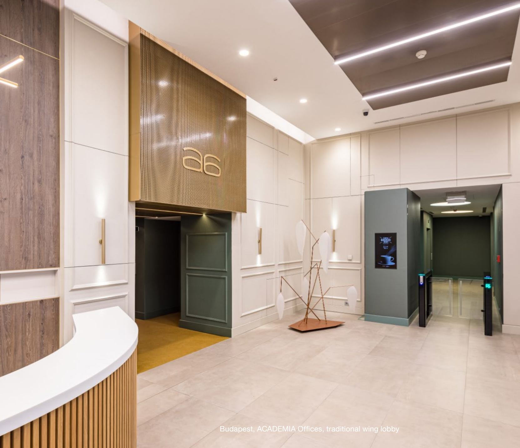
Budapest, ACADEMIA Offices, traditional wing lobby