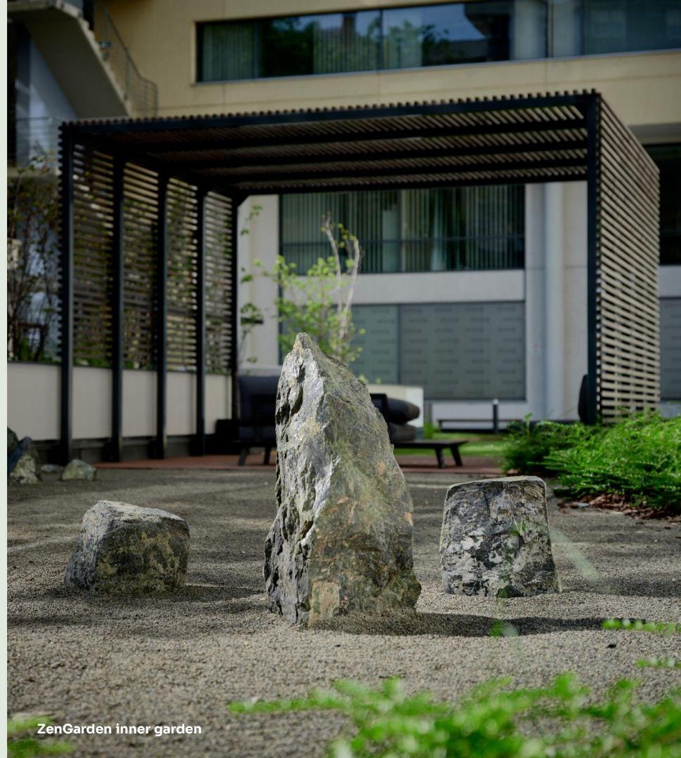
ZenGarden inner garden

We create sustainable, long-term value in our commercial real estate portfolio through disciplined risk management and resilient development strategies.